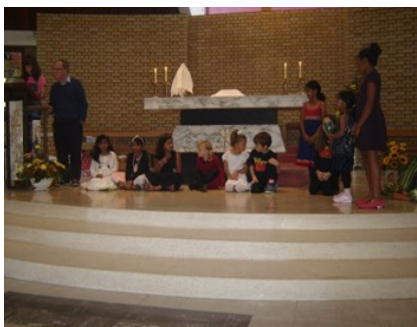
The Wedding Feast at Cana

Key Stage One have also had assemblies where they have been able to use their rosaries.