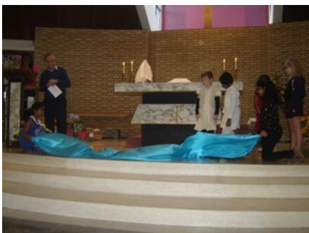
The Baptism of Jesus