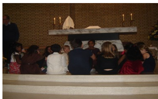
The Institution of the Eucharist

We have included some photos that we would like to share with you from the Rosary Service at church.