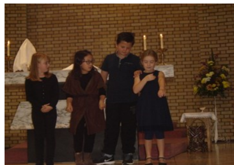
Jesus heals the sick